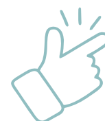
Compact and easy to use

The extended battery backup period allows interrupted therapy to continue even during power failures.