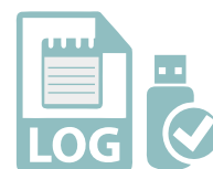
Data log and transfer

Captures the temperature of the infant for a period of 72 hrs which can help the caregiver determine the course of the treatment